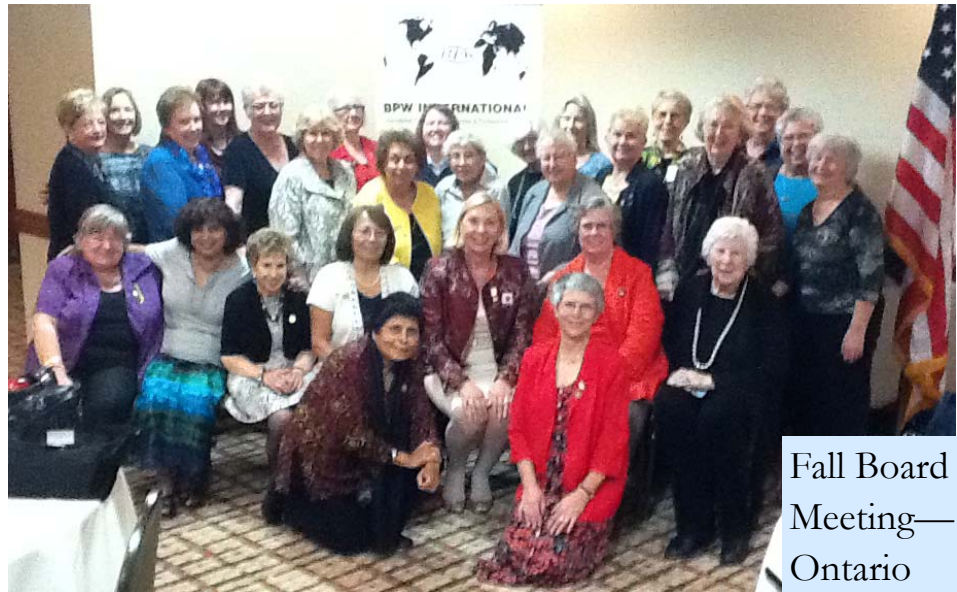
Fall Board Meeting— Ontario